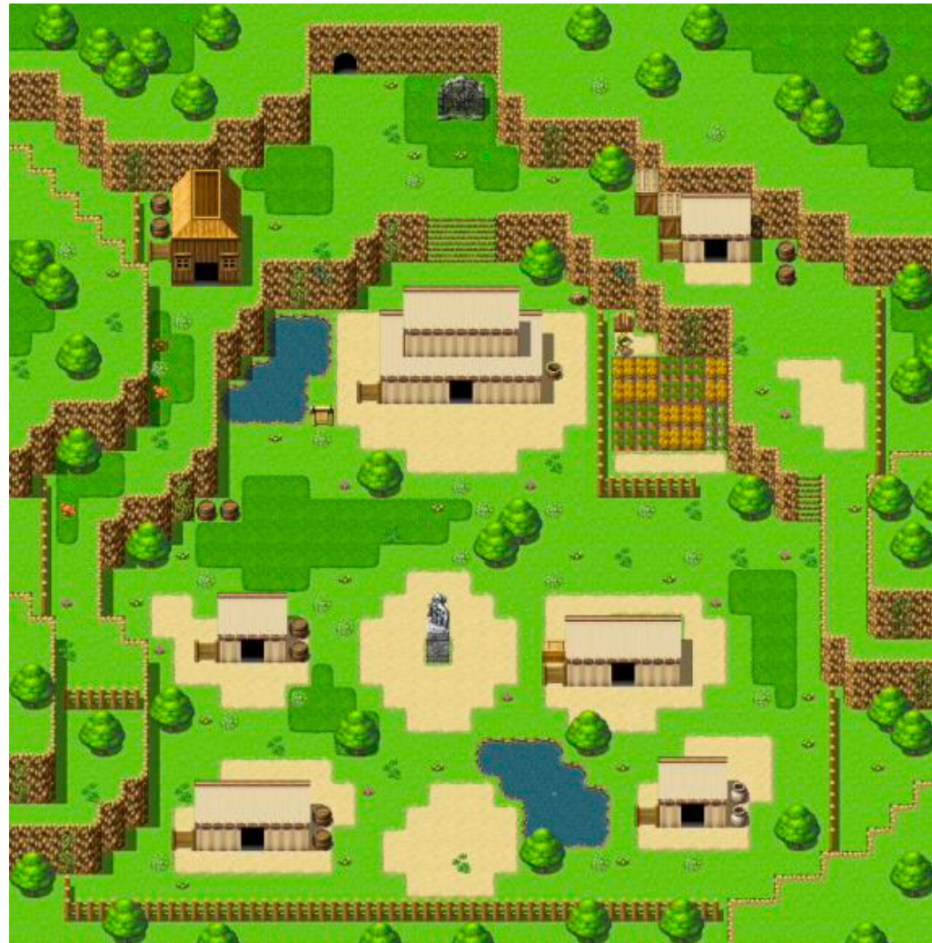
Abbildung 2: Nomadendorf mit Lernstationen zur Mitose und Meiose