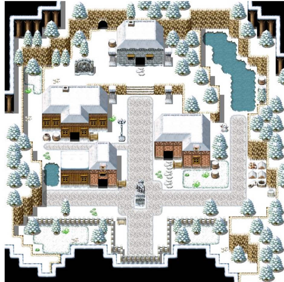
Abbildung 3: Schneestadt mit Lernstationen zur Proteinbiosynthese